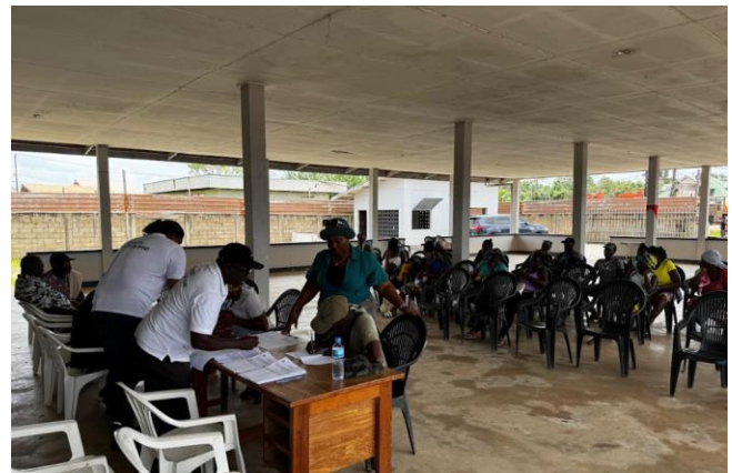
Contract signing New Core Hinterland (Moengo Tapoe, Mora Kondre)