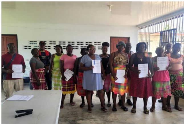
Contract signing New Core Hinterland (Poki Gron, Brownswey)

We also saw major developments in the hinterland component. In the district of Marowijne , particularly in the interior regions , where over 100 applicants from villages such as Galibi, Mora Kondre, and Moengo Tapoe signed contracts with their respective contractors to begin building new homes.